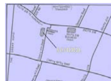
The Waldorf School of Princeton 1062 Cherry Hill Road Princeton, NJ 08540

See www.princetonwaldorf.org – for more Enrichment Workshops