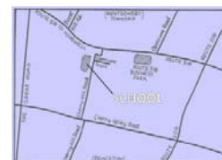
The Waldorf School of Princeton 1062 Cherry Hill Road Princeton, NJ 08540

See www.princetonwaldorf.org – for more Enrichment Workshops